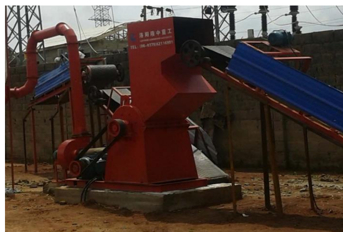
Figure 2. 9: E-waste recycling facility operated by Lagos State Government in collaboration with MSC in Lagos