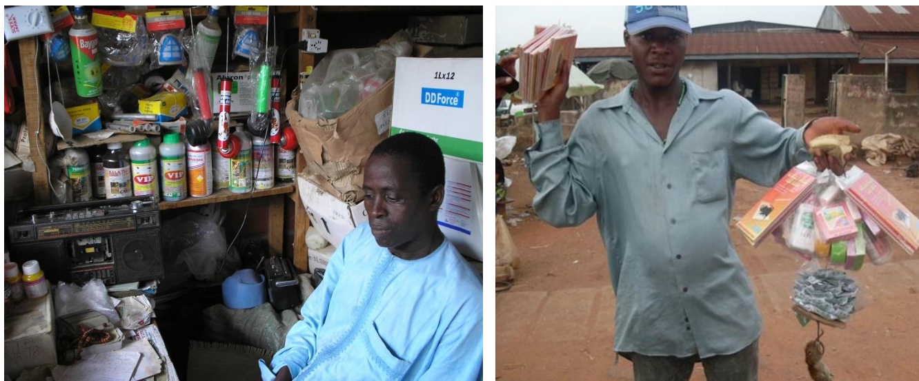
Figure 2. 2: Pesticide peddlers in action

Chemicals poisoning incidents are common among illiterate farmers and others who apply POPs and other chemicals without adequate safety measures, occasioning exposure risks and attendant burdens of morbidity and mortality. Acute and chronic pesticide poisoning usually results from consumption of contaminated food, chemical accidents in industries and occupational exposure in agriculture. Pesticides are the major causes of cancer, cardiovascular diseases, dermatitis, birth defects, impaired immune functions, neurobehavioral disorder and allergy sensitization reaction (Erhunmwunse et al., 2012).