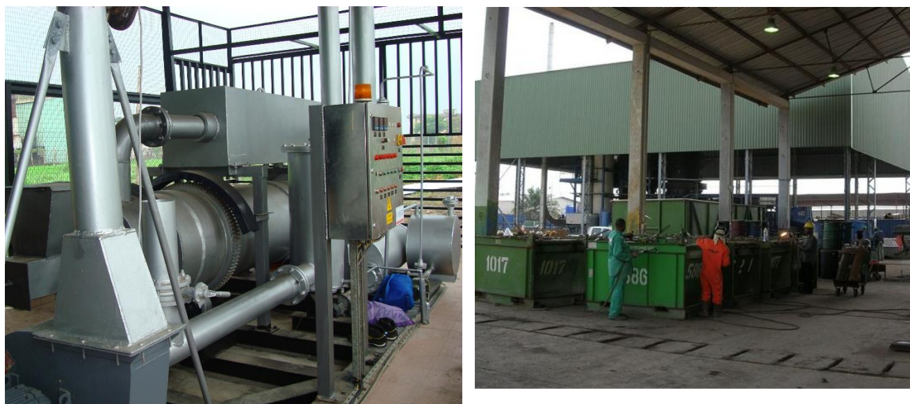
Figure 2. 4: An Incinerating facility for HCW management built by Lagos State Government (left) and another incinerator at Lagos University Teaching Hospital (right) in Lagos

In an attempt to address this challenge with the available resources of the Government, some tertiary health institutions (University of Ilorin Teaching Hospital, Lagos University Teaching Hospital, Federal Medical Centre, Owo, National Pharmaceutical Research Institute (NAPRI) Idu – Abuja, National Orthopaedic Hospital, Igbobi, National Hospital, Abuja, among others) have been equipped with functional incinerators articulated with scrubbers, to assist them in managing their medical wastes in an environmentally sound manner (figure 2.4). With the success recorded under the National Hospital Intervention Scheme, efforts are ongoing to extend same gesture to remaining Federal Medical Institutions.