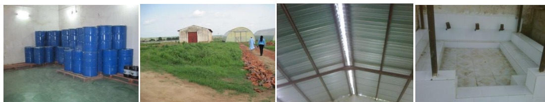
Storage facility in Minna