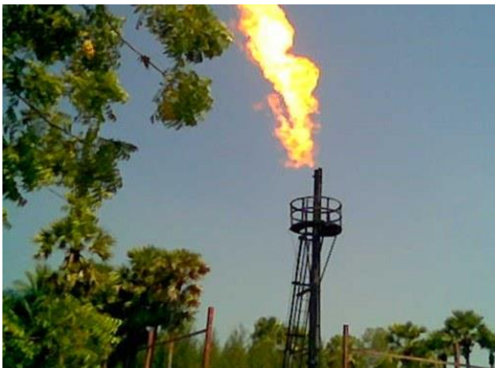
Figure 2. 5: Gas flaring in the oil and gas

Currently, gas flaring could be regarded as a significant source of UPOPs in Nigeria, thus, technical and financial supports are required by the Government in its efforts to reduce the environmentally damaging flaring and venting of gas associated with the extraction of crude oil, with the ultimate goal of actualizing gas re-utilization for clean energy production and cognate applications.