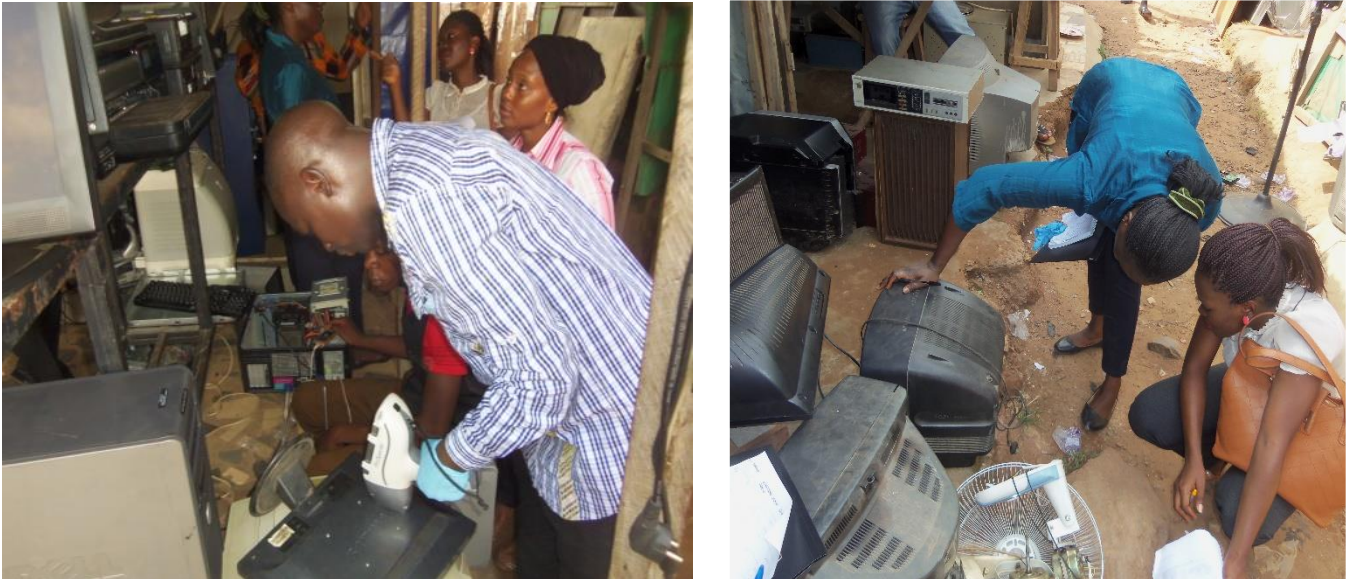
Figure 2. 17: PBDE inventory in electronic equipment and vehicles

metals. It operates on Microsoft windows software and works by exposing the material to an X-ray beam. This causes the individual elements of the material to emit light with characteristic wavelengths, thereby making it possible to determine the elemental composition based on the intensity of the individual wavelengths of the emitted light. The "depth" of the measurement depends on the light dispersal in the material.