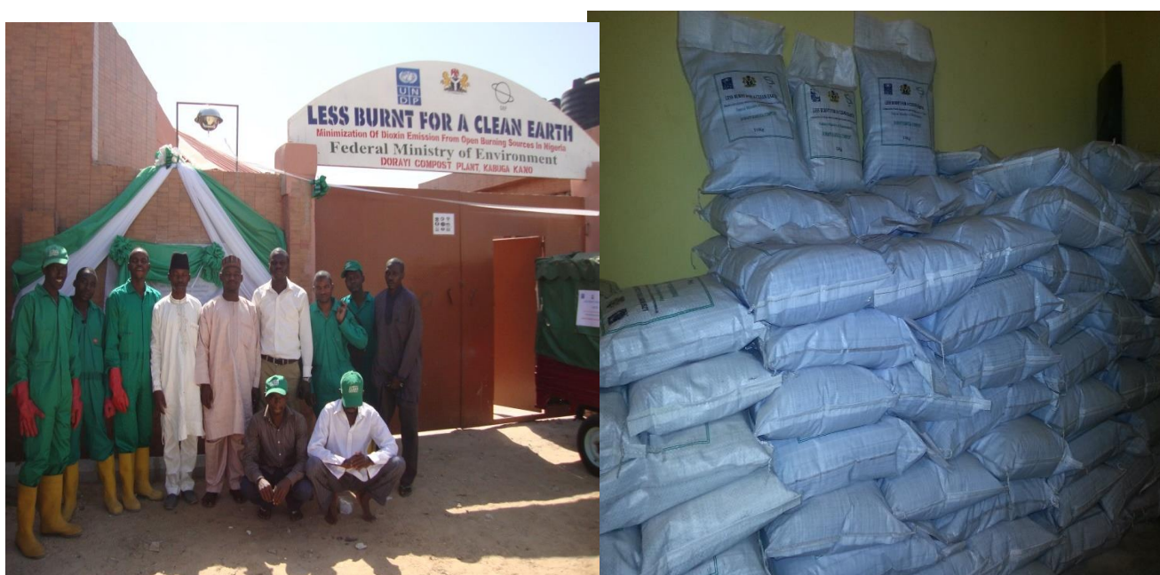
Figure 2. 6: Composting facility established by UOPs Project in Kano