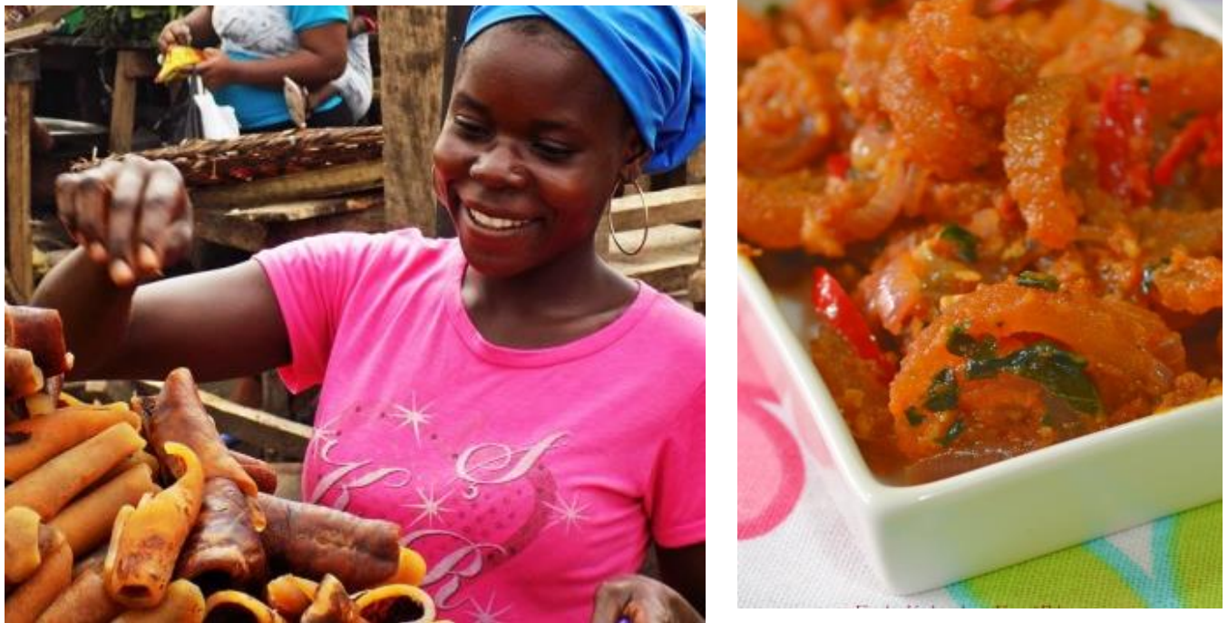
Figure 2. 7: Singed and boiled cow hides (ponmo), a native delicacy in Nigeria

(USEPA, 1994; ATSDR, 1998). Furthermore, hides singed this way and boiled are consumed as local delicacy known as ‘ponmo’ (fig 2.7).