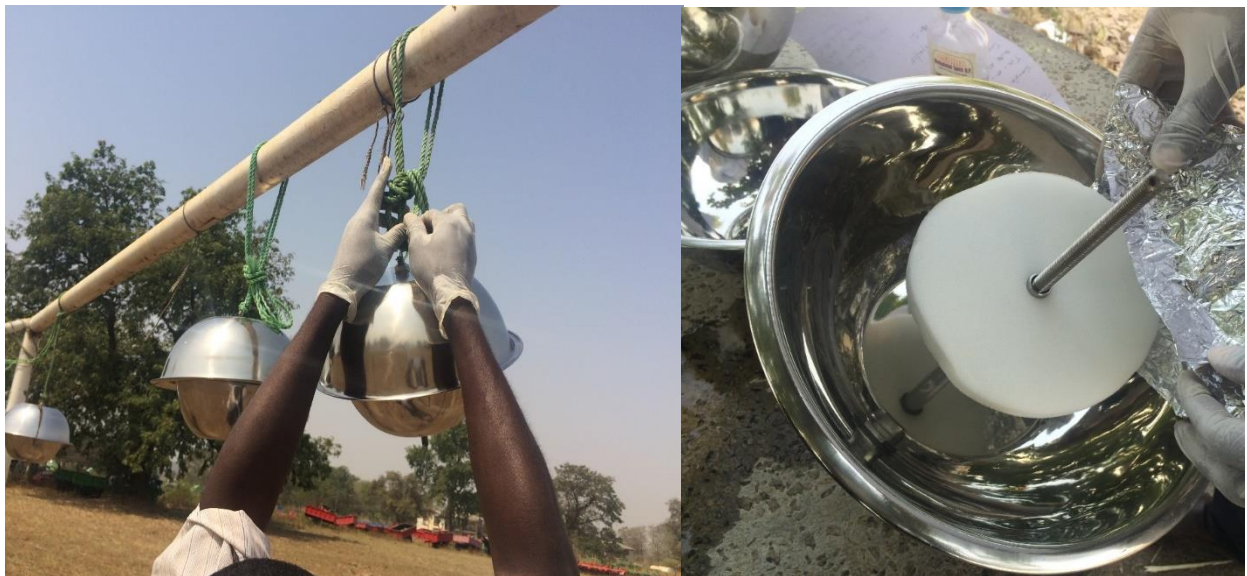
Figure 2. 13: Passive Air Sampling kits being mounted

Jawura Environmental laboratory Lagos revealed concentrations of Dieldrin, Chlordanes, Mirex, Endosulfans, among others (UNEP, 2009). Figure 2.13 depicts Passive Air Sampling kits (bearing treated Polyurethane media), being installed during one of the campaigns.