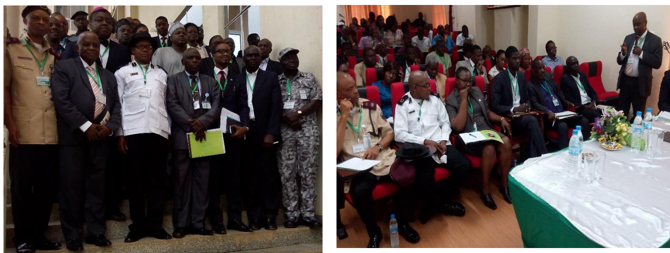
Figure 1. 4: Stakeholders at the POPs Inventory Data Validation Workshop

A communiqué was issued at the end of the workshop (Annex III). Annex IV is the list of sectoral representatives who participated at the POPs Inventory Data Validation Workshop.