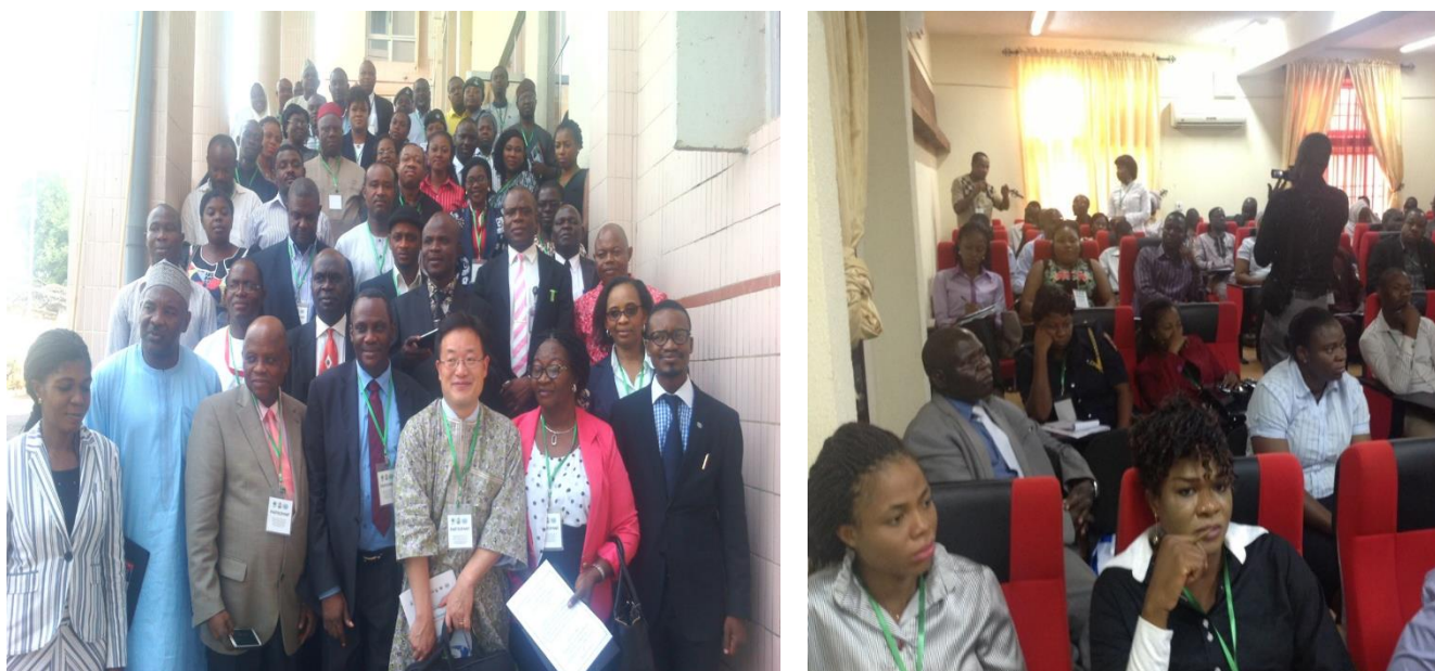
Figure 1. 3: Sectoral stakeholders at the POPs Inventory Training Workshop.