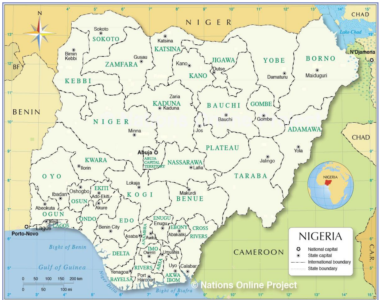
Figure 2. 1: A Map showing countries that share common boundaries with Nigeria