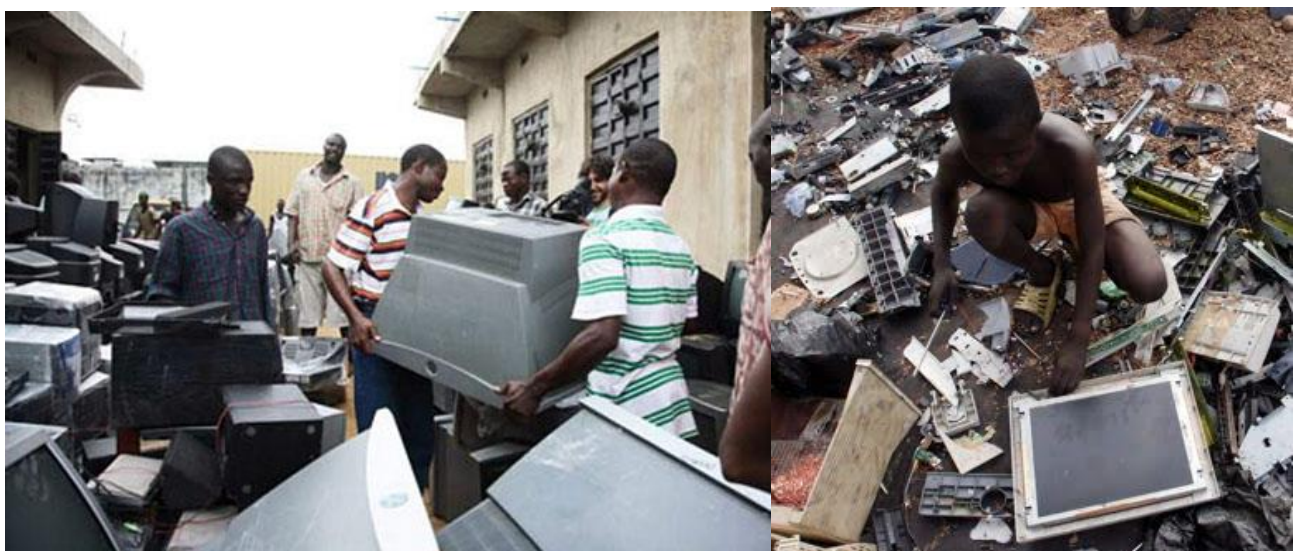
Figure 2. 8: Waste electrical electronic equipment: a source of environmental and health challenges

Recycling and disposal of hazardous e-waste may involve significant risk to workers and communities and great care must be taken to avoid unsafe exposure in recycling operations and leaching of a material such as heavy metals from landfills and incinerator ashes.