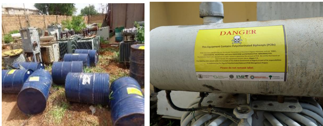
Figure 2. 15: A drum of PCBs oil observed and an on-line transformer on site

During the inventory exercise, information obtained from NCS revealed that a total of 1,254,716kg of Endrin/HCBs and PCBs/HBB/PeCBs was imported into Nigeria between 2011 and 2014 and originated from countries including Denmark, India, China, Netherlands, Belgium and Spain. In the power sector of Nigeria, a total number of 1,590 equipment were inventoried from Generation, Transmission, Distribution facilities which included 1,157 transformers, 250 capacitors, 26 reactors, 45 ring main units, 79 oil circuit breakers and 33 oil filtration Machines. Figure 2.14 shows a drum of PCBs oil observed and an on-line transformer on site.