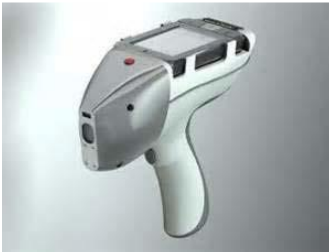
Figure 2. 16: Handheld XRF spectrophotometer