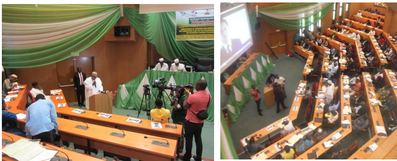
Figure 1. 5: Stakeholders at the updated NIP Endorsement Workshop

Figure 1.5 shows the pictures of stakeholders at the updated NIP Endorsement Workshop.