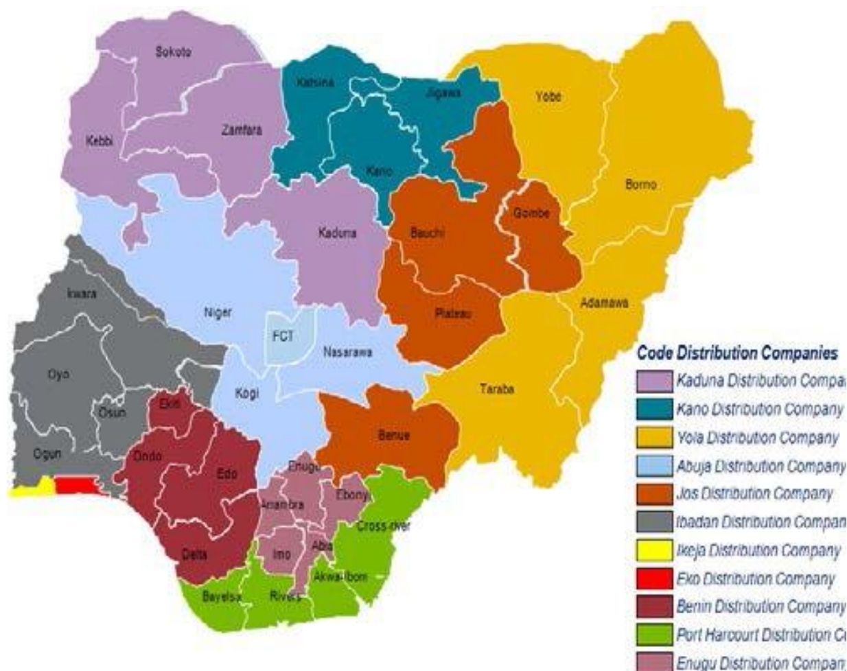
Figure 2. 14: DISCO's catchment areas