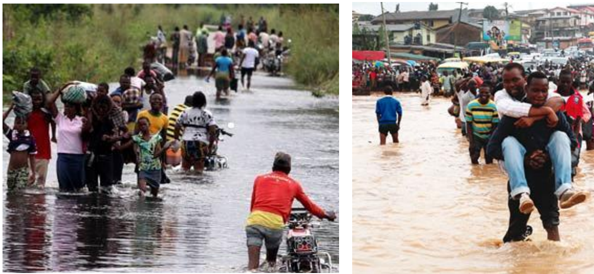
Figure 2. 3: Flash floods of this nature have the tendency to dislodge obsolete POPs stockpiles