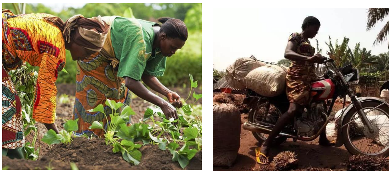
Figure 2.12: Women farmers as primary providers for the family (Source: Transformation, 2014).

It has been established that several factors, including differences in occupational roles, household responsibilities, and biological susceptibility impact gender differences in exposure to toxic chemicals and the resulting health impacts. In Nigeria, chemical poisoning incidents are common among women farmers, the elderly and children, who apply POP-chemicals on farm or indoors, without adequate preventive or protective measures. Figure 2.12 shows women at work during cropping and harvest stages, playing their traditional roles as primary providers for the family.