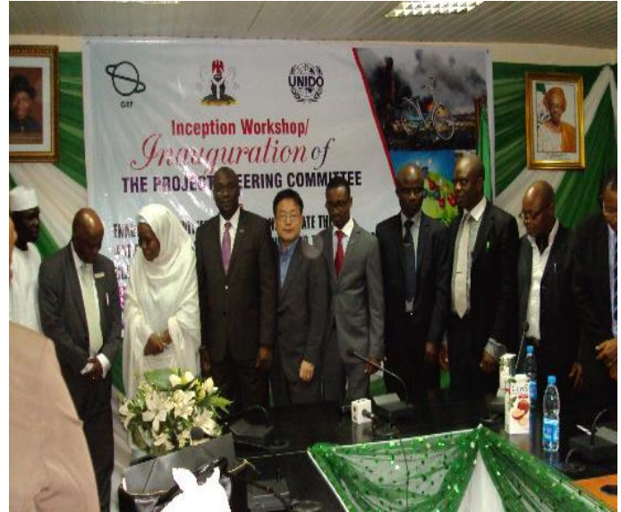
Figure 1. 2: PSC and PCU members and Development Partners at the Inception Workshop

The Coordination Mechanism encompasses the PSC and Project Coordinating Unit (PCU), as outlined in Annex I.