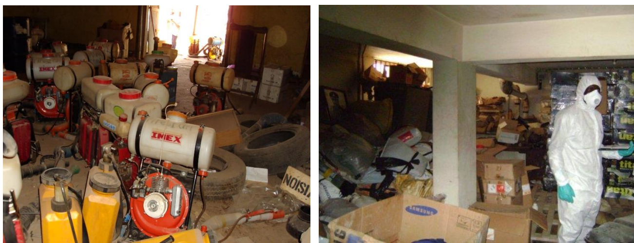
Figure 2. 10: Obsolete POPs pesticide stock being inventoried

The need for effective clean-up of this stockpiled pesticides led to the adoption of the African Stockpiles Programme, a multi-stakeholder initiative, conceptualized to be implemented in a number of African countries over a 12-15-year period on a rolling basis in which Nigeria participated. The Africa Stockpiles Programme in Nigeria (Nigeria-ASP) was conducted between September 2006 and June 2010 with a detailed inventory of obsolete pesticide stocks and associated waste in Government-owned stores and their locations, conducted in thirty-six states and FCT (Table 2.2). Figure 2.10 shows obsolete pesticide stocks being inventoried.