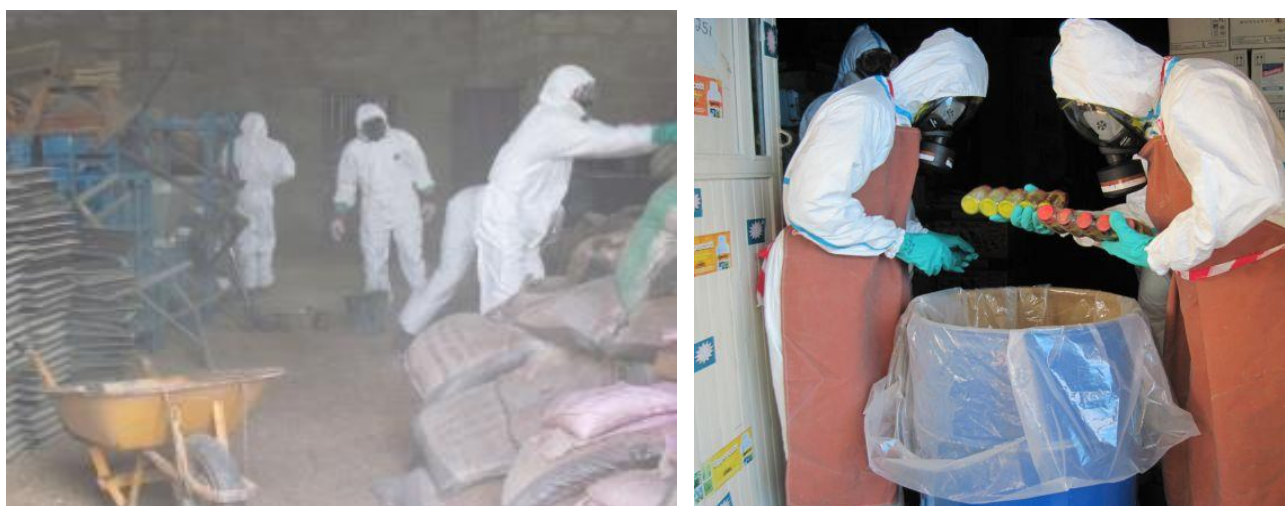
Figure 2. 11: Safeguarding of obsolete pesticides during Cleanfarms Project

Furthermore, 32MT of obsolete Dichlorvos (DDVP) 100%, imported from India, was discovered in a private pesticide merchant store during the CleanFarms project Inventory activity. The consignment was destroyed at an incinerating facility in Port-Harcourt, Rivers State (CLI, 2010). Annex VIII shows the CleanFarms pilot inventory data.